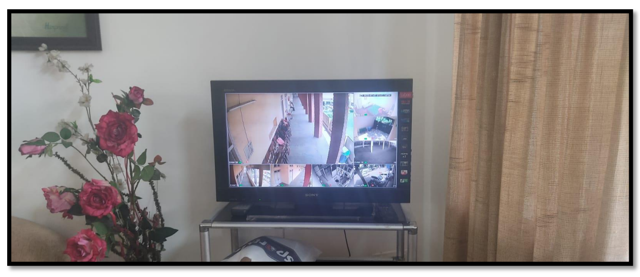
Camera telecast in Principal Office