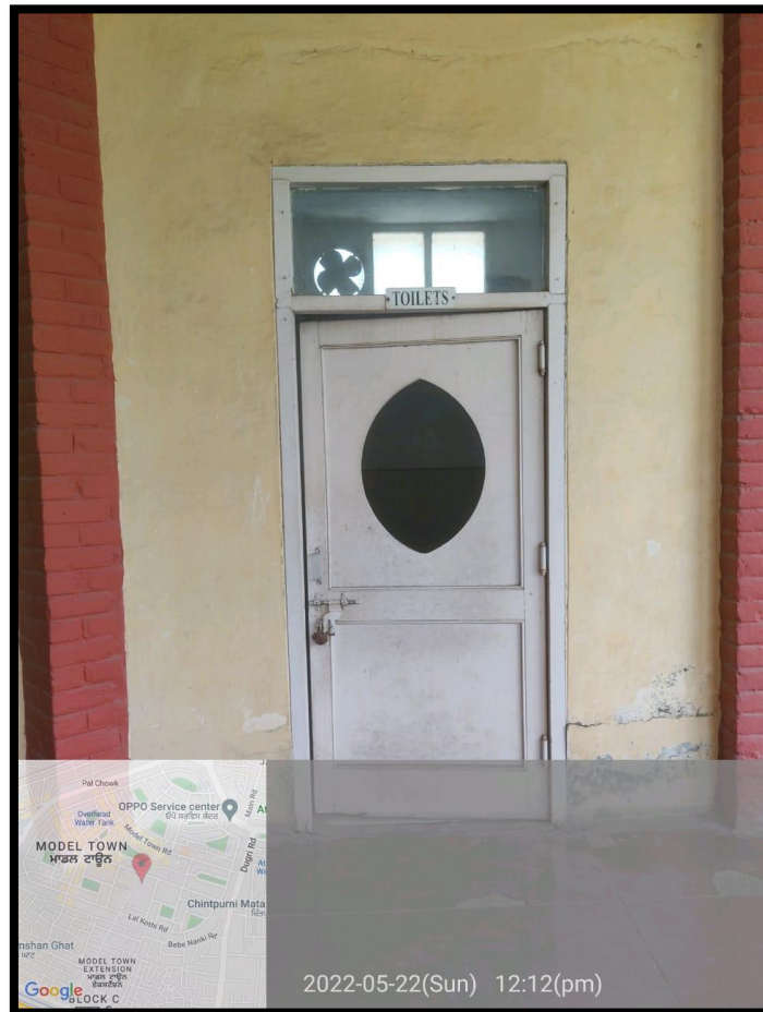
Washrooms for women students