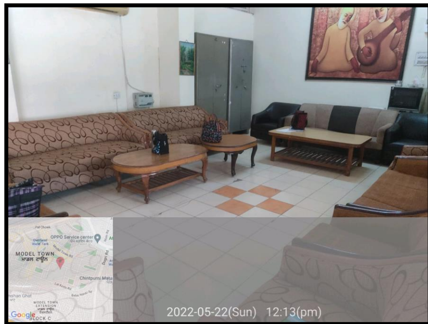
Staff room for women staff