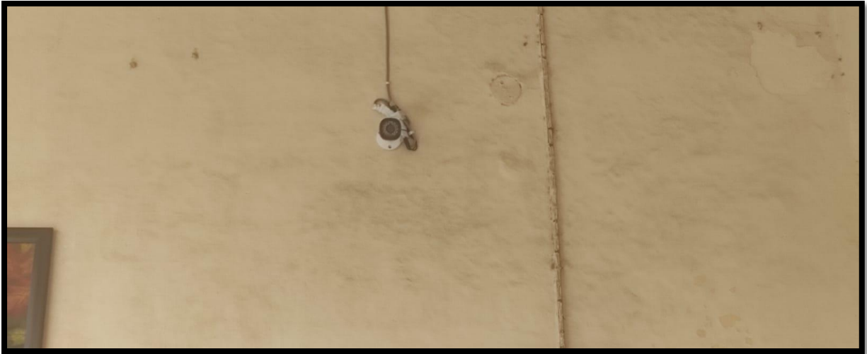
High quality cameras installed in the campus