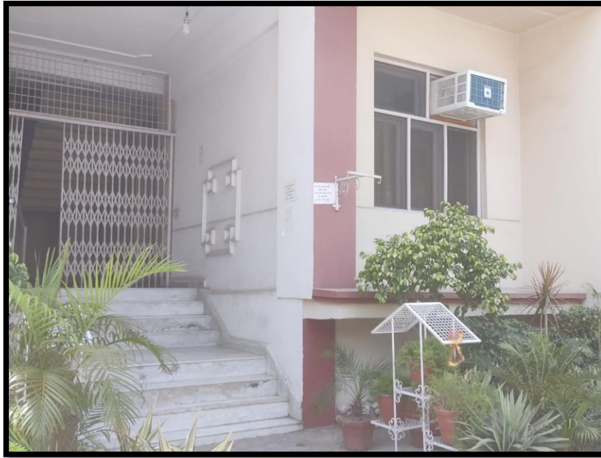
Girls hostel for women students