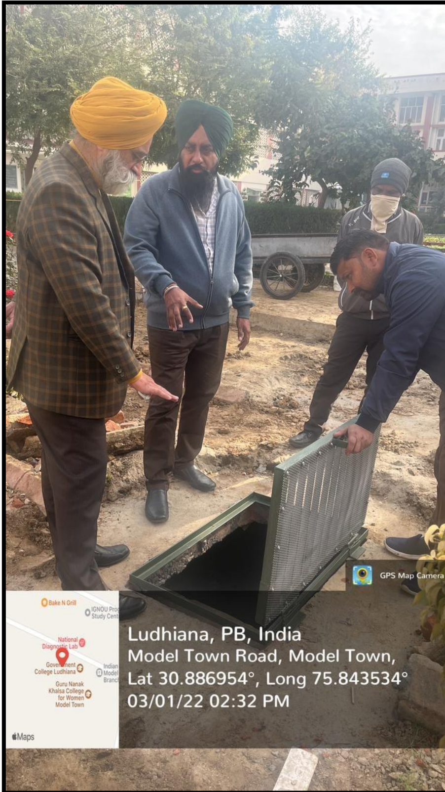
Open well recharge