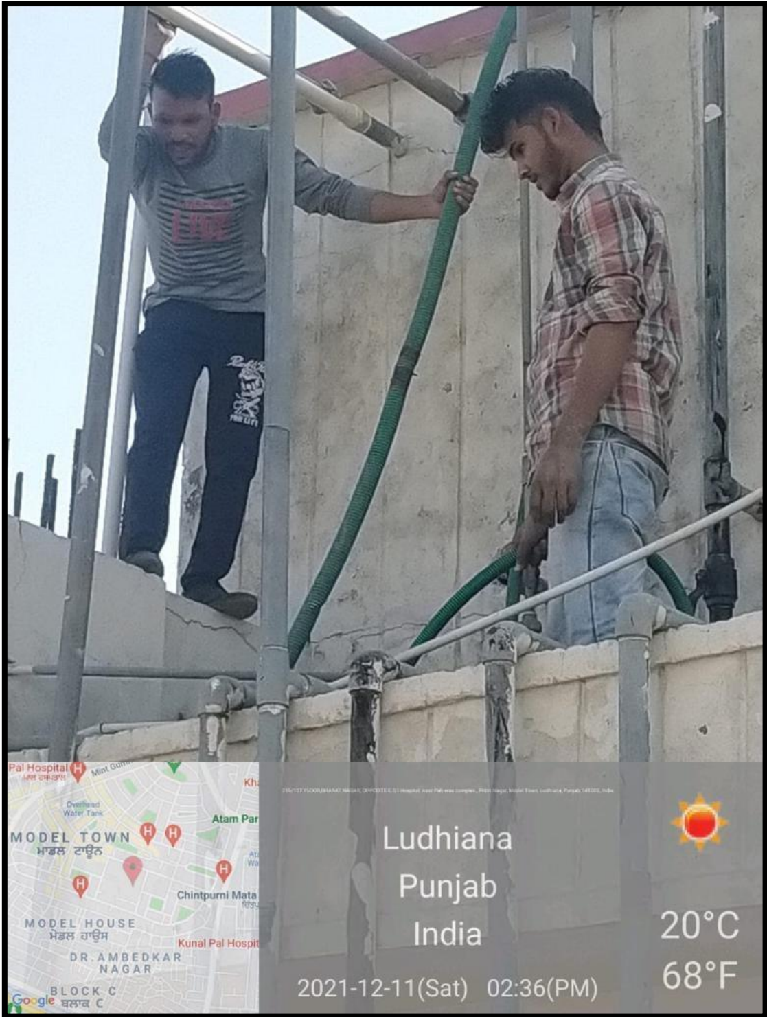
Cleaning of water tanks