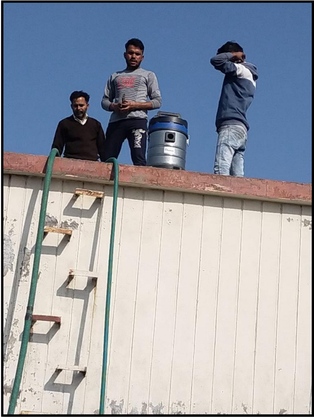
Cleaning of water tanks