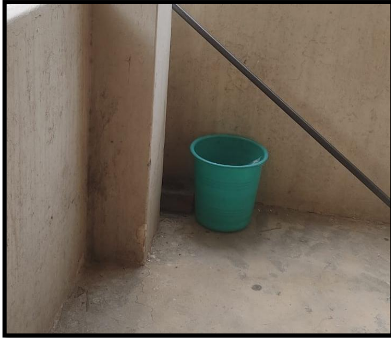
Dustbin outside washroom