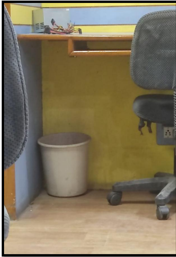
Dustbin in computer lab