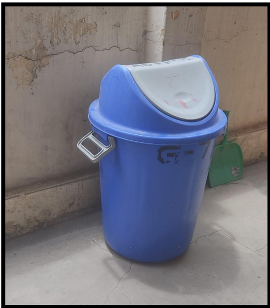
Dustbin in corridor