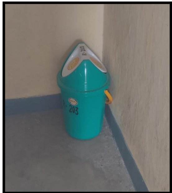
Dustbin in classroom