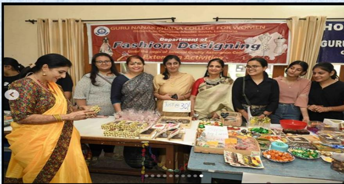
Day 1 Part 2