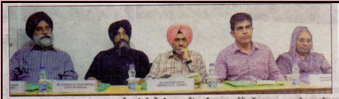
ਗੁਰੂ ਨਾਨਕ ਖਾਲਸਾ ਕਾਲਜ ਫਾਰ ਵੂਮੈਨ ਵਿਖੇ ਸੈਮੀਨਾਰ ਸਮੇਂ ਸ਼ਾਮਿਲ ਪੜਵੇਂਤੋ ਸੱਜਣ ।