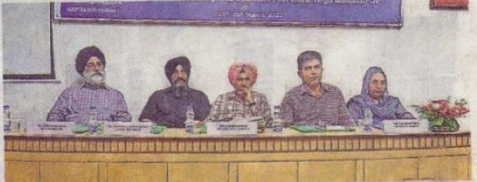
ਲੁਧਿਆਣਾ ਕੇ ਗੁਰੂ ਨਾਨਕ ਖਾਲਸਾ ਕਾਲੇਜ ਫਾਰ ਵੂਮੈਨ ਗੁਜਰਖਾਨ ਕੈਂਪਸ ਮੈਂ ਆਯੋਜਿਤ ਸੰਗੋਠੀ ਕੇ ਅੰਤਿਮ ਦਿਨ ਮੀਜੂਦ ਕਰਕਾ ਸਦਸ੍ਯ ਭਿਡਾਇ