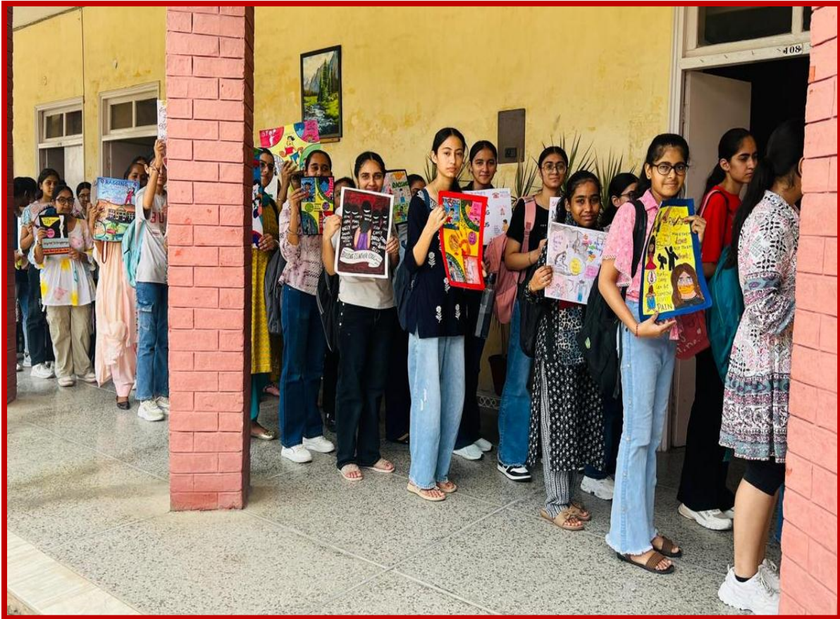
ANTI-RAGGING WEEK FROM AUGUST 12-18, 2024