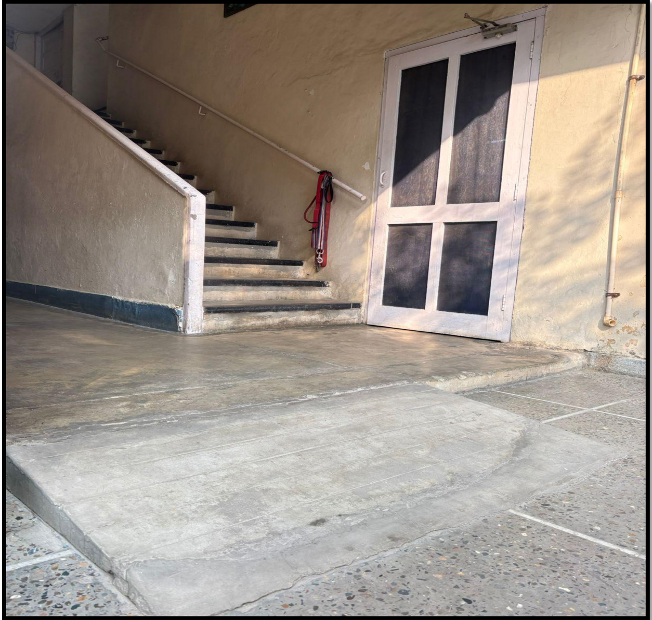
RAMP NEAR MUSIC ROOM

The campus has constructed ramps to provide all students and employees with a comprehensive and inclusive teaching and learning environment, free of physical barrier. These structures facilitate unhindered movement for individuals with diverse abilities who use wheelchairs.