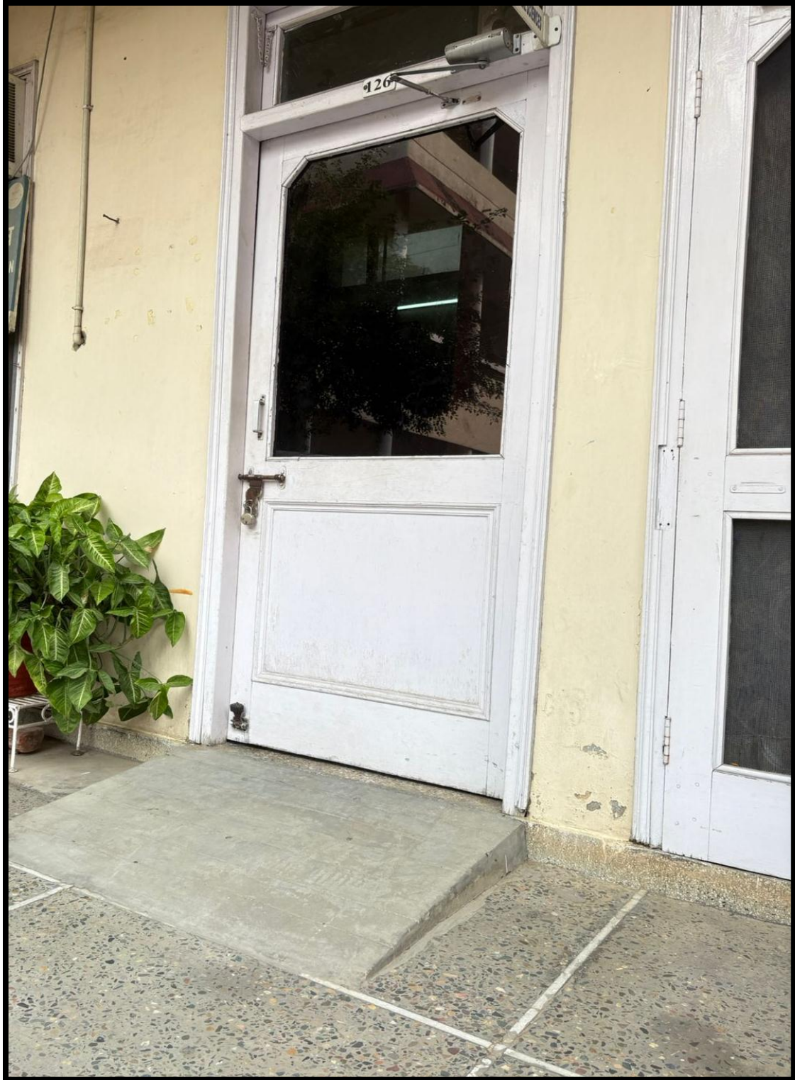
MEDICAL ROOM RAMP