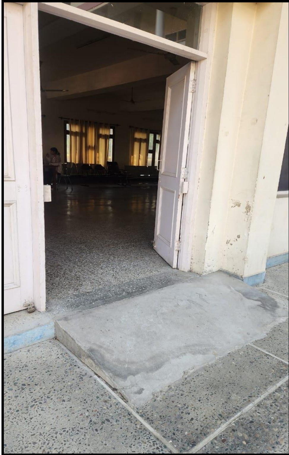
COMMON HALL RAMP