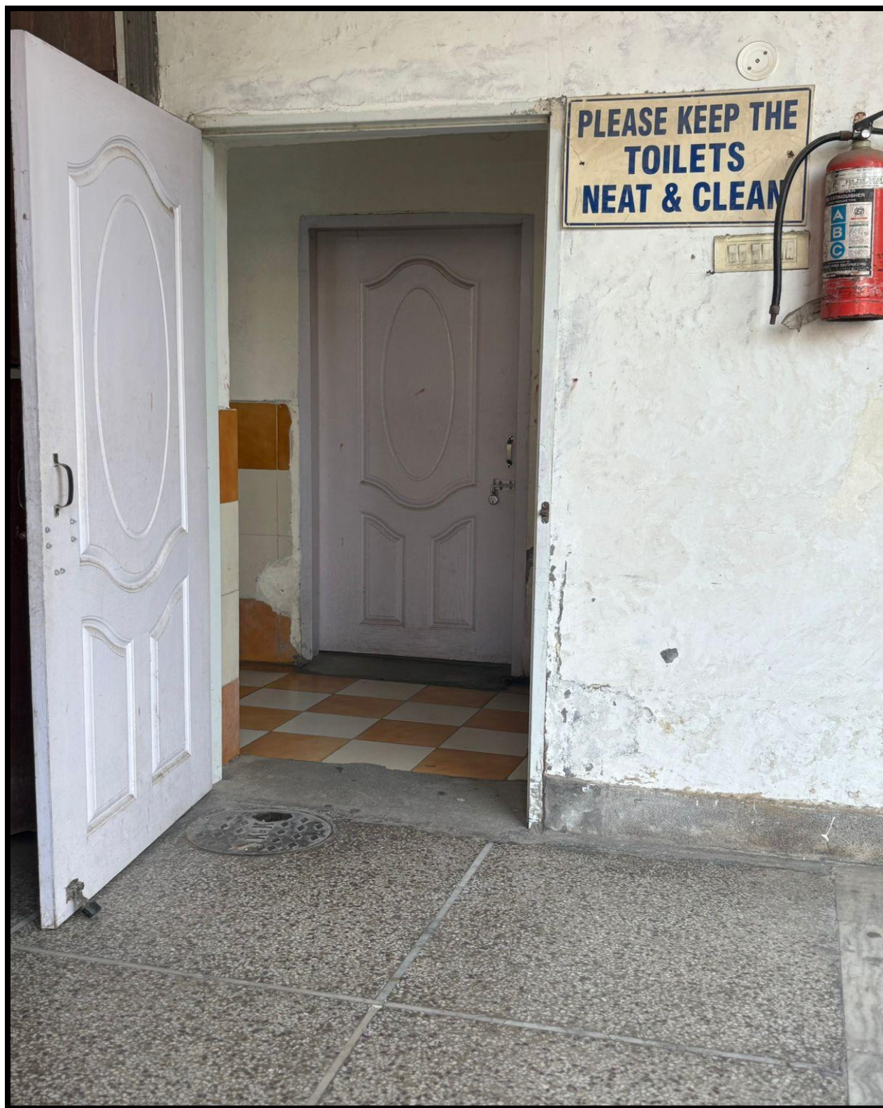
DIFFERENTLY ABLED FRIENDLY RESTROOM