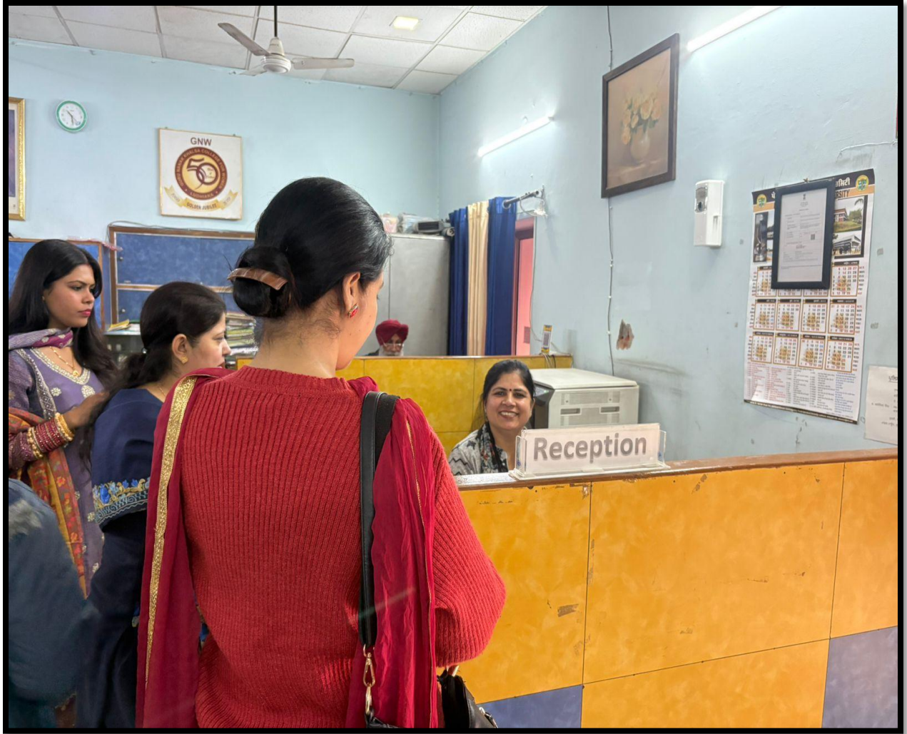
PROVISION FOR ENQUIRY AND HUMAN ASSISTANCE