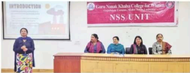
A speaker addresses students during an awareness session on National Pollution Control Day organised by the NSS Unit at Guru Nanak Khalsa College for Women, Model Town, Ludhiana.

Ludhiana: Under the aegis of the Internal Quality Assurance Cell, the NSS Unit, EBSB Club, Red Cross Society, and the Department of Environment Science, Guru Nanak Khalsa College for Women observed National Pollution Control Day on the college campus today. The day is commemorated every year on December 2 to honor the lives lost during the Bhopal Gas Tragedy and to raise awareness about the urgent need to curb pollution and promote safer environmental practices.