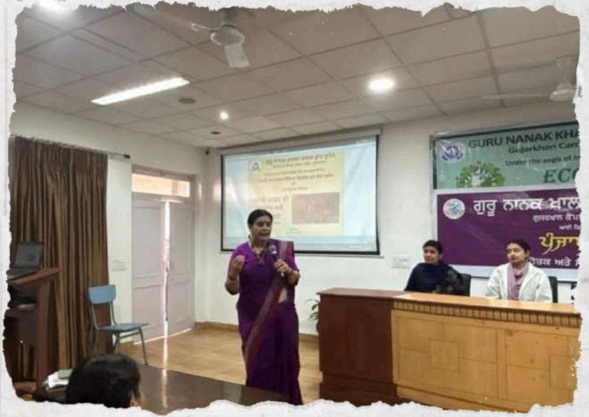
Panel Discussion and Joint Bookrunner