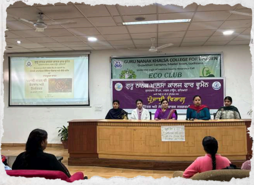
Panel Discussion and Joint Bookrunner