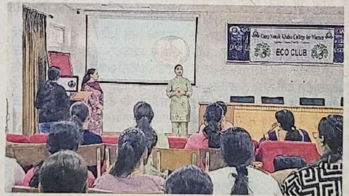
ਗੁਰੂ ਨਾਨਕ ਖਾਲਸਾ ਕਾਲਜ ਵਿਖੇ ਸਮਾਗਮ ਦੌਰਾਨ ਸੰਬੋਧਨ ਕਰਦੀ ਵਿਦਿਆਰਥਣ ਅਤੇ ਹਾਜ਼ਰ ਅਧਿਆਪਕ ਤੇ ਵਿਦਿਆਰਥੀ